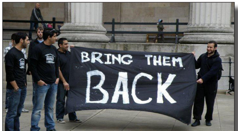
Cypriot students demonstrating in front of the British Museum, Oct., 25, 2010.